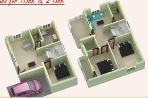
Model plans for 1Bhk & 2 Bhk

SMART PEOPLE BUY THE SMART CITY... AND YOU ?